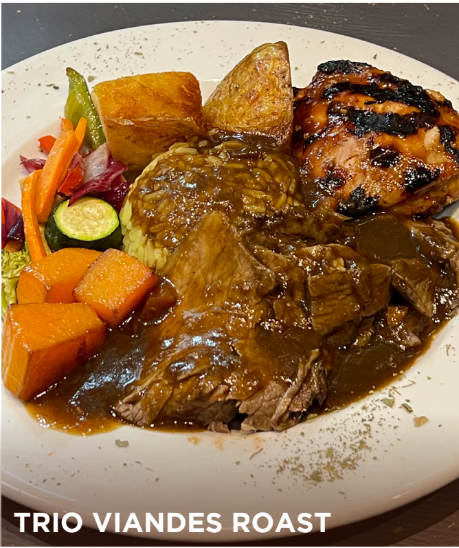
TRIO VIANDES ROAST